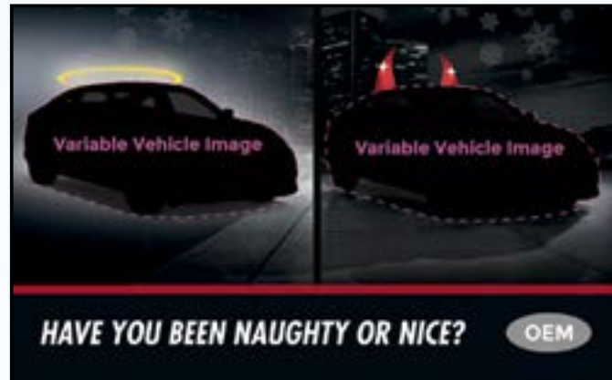
NAUGHTY OR NICE